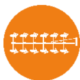
Land Preparation Equipment