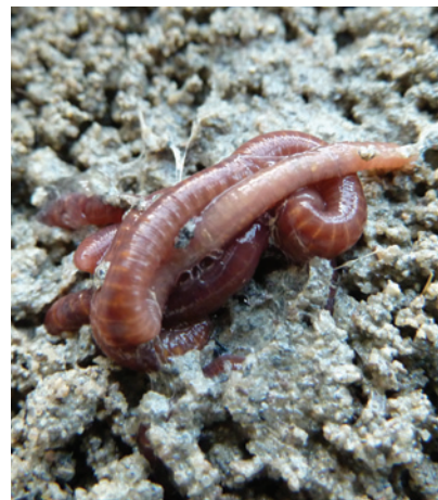
NT Soil organisms Niefern, Germany