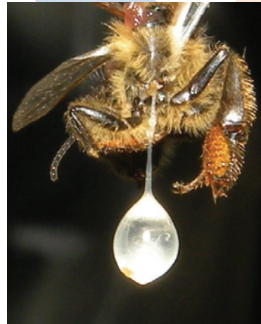
Collecting honey stomachs to determine residues of a pesticide in nectar NC, USA & Niefern, Germany